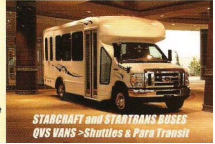
STARCRAFT and STARTRANS BUSES QVS VANS >Shuttles & Para Transit